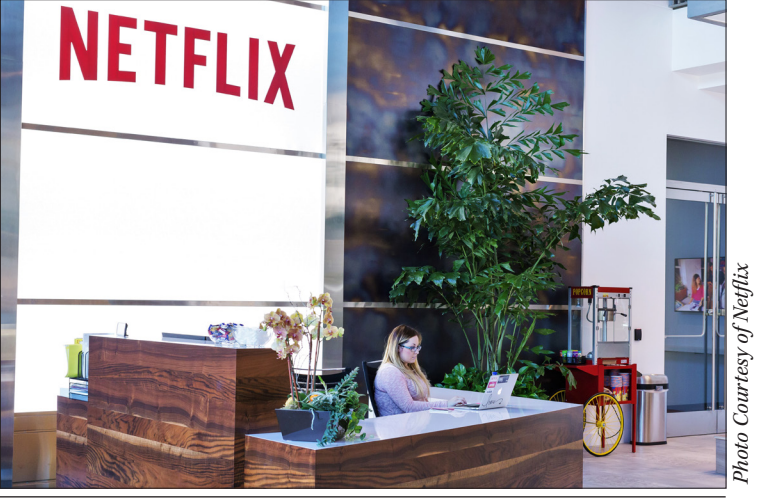
"The Cloverfield Paradox" was a surprise release right after Super Bowl LII.