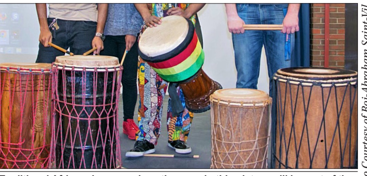
Traditional African drums such as the ones in this picture will be part of the performance.

You can reach the author at coby.ezra@gmail.com